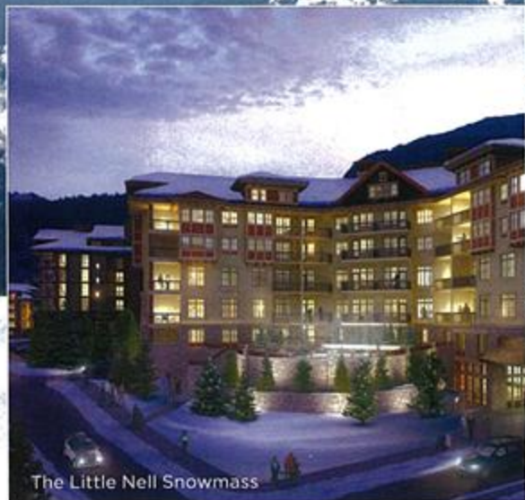
The Little Nell Snowmass